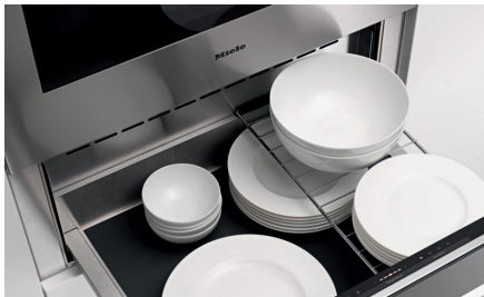
Movable half rack insert