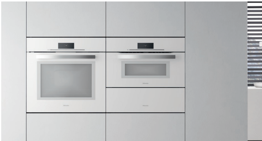
Side-by-side combination 30" Convection Oven with 30" Speed Oven and new Warming Drawer